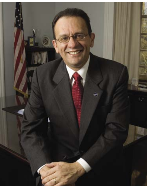
Eddie A. Perez Mayor