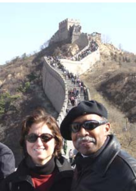
At the Great Wall of China