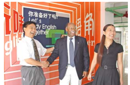
In this corner of the school, only English can be spoken!