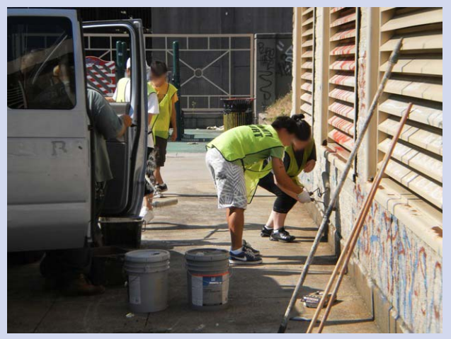
Working with Riverfront Recapture and Knox Parks Foundation to clean up graffiti in Hartford