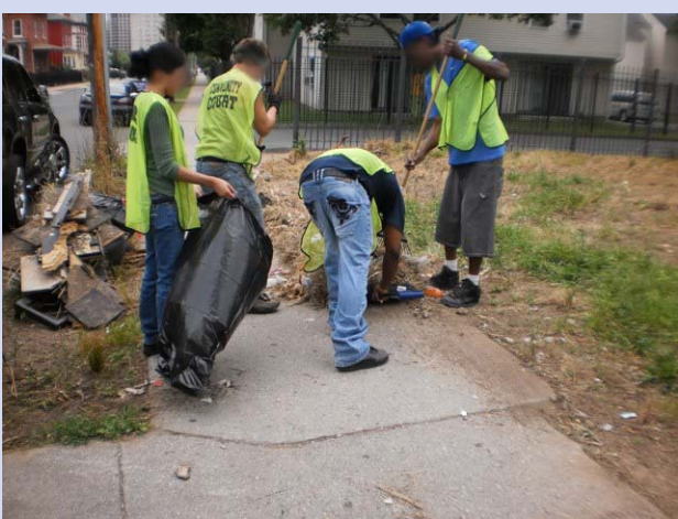
Cleaning up litter and debris on streets throughout Hartford