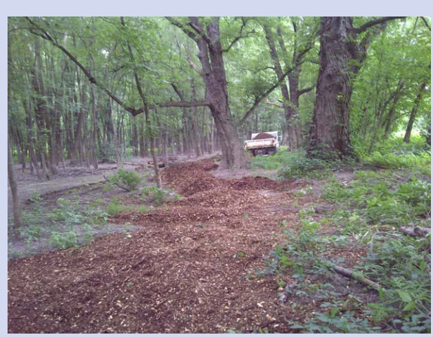
Community Court Community Service crews spreading wood chips on the new trail

The Community Court in Hartford requires most defendants to perform court-supervised community service to resolve their court case. The Community Court tries to have the defendants perform projects that will have a positive impact on the city. Projects are varied, ranging from picking up litter on Hartford streets, to graffiti removal, to working with Riverfront Recapture to clean the areas near the river and to build walking trails, to snow removal for the elderly, to helping bundle wood at the non-profit Open Hearth wood yard, among many other projects. Here are a few pictures of the community service work crews at work on these projects.