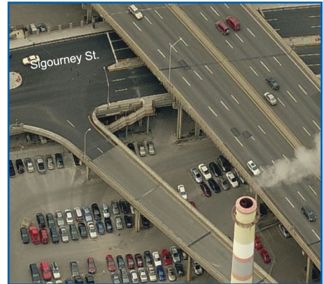
Looking down on I-84 Viaduct and Sigourney Street and the undesirable surface lots below