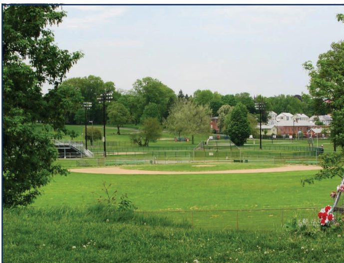
Baseball field at Colt Park

and swimming pools will remain open this week (the week before school starts in Hartford) which is one extra week beyond what has already been scheduled.